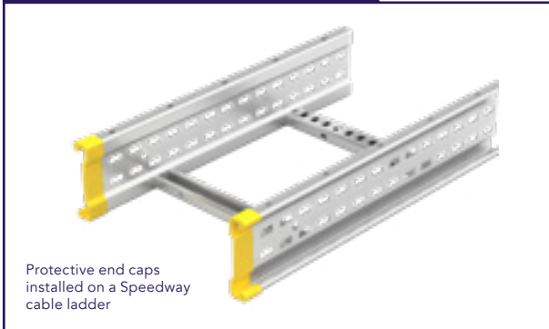
Protective end caps installed on a Speedway cable ladder